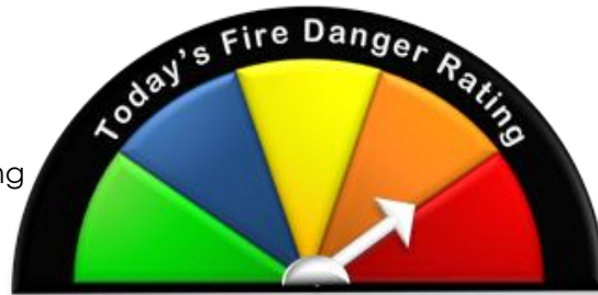
North Dakota Adjective Fire Danger